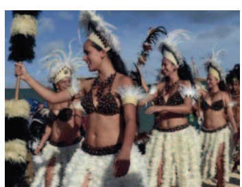
FestPac closing ceremonies are today