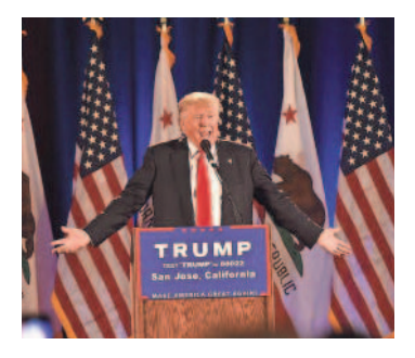
TRUMP TIED TO 3,500 LAWSUITS